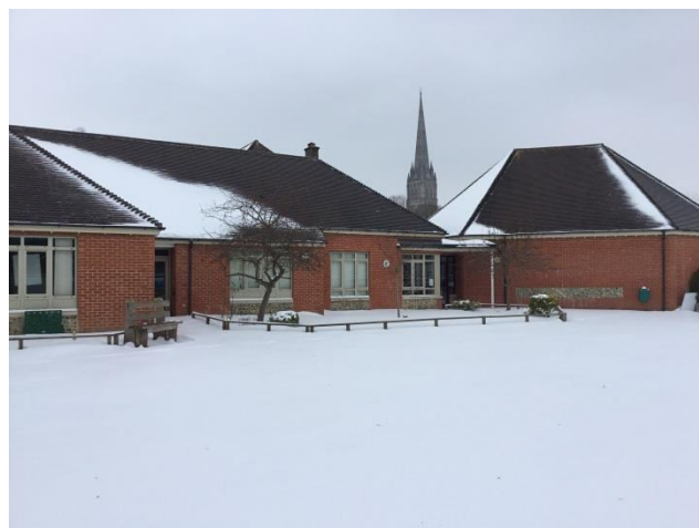
I thought you might like this – 02/03/18

I can understand that it must have been difficult making changes to your arrangements as a result of the school not being open. I hope that you understand that closing the school is not a decision I take lightly but this was an exceptional event and our duty of care demands that we consider the safety of our children, staff and parents. The children might not agree with me, but can we have spring now..?